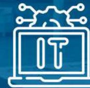
Information Technology and Computer Science